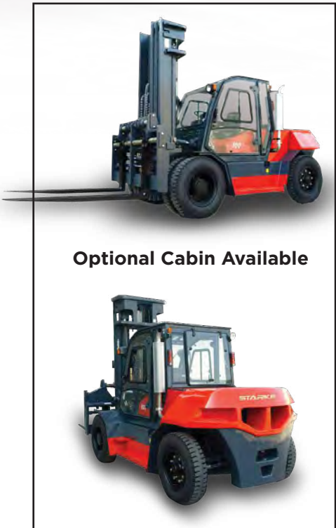
Optional Cabin Available