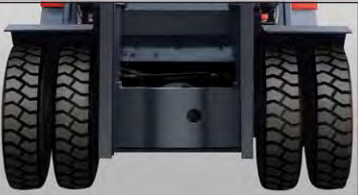
Stable Dual Front Wheels

Built with rugged transmissions and industry-standard engines engineered for reduced noise and emissions, all Professional Series trucks provide a durable power train designed to protect your working environment and operate with outstanding efficiency.