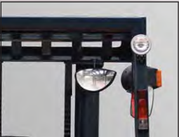
Wide Angle Rearview Mirrors