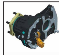
Wet Disc Brakes