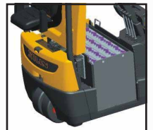
Side Load Battery